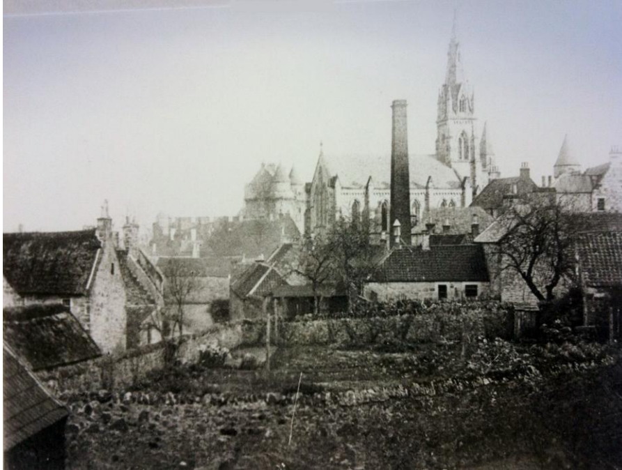
Gas Works in the distance (chimney) at the Gas Works