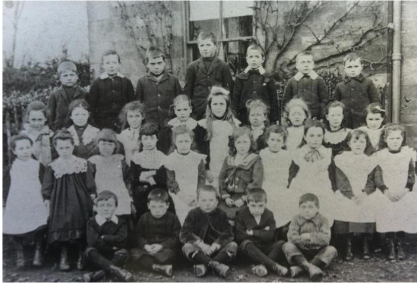
Falkland School Group 1902