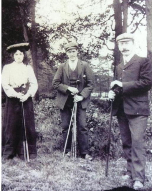
Falkland Golf Club golfers